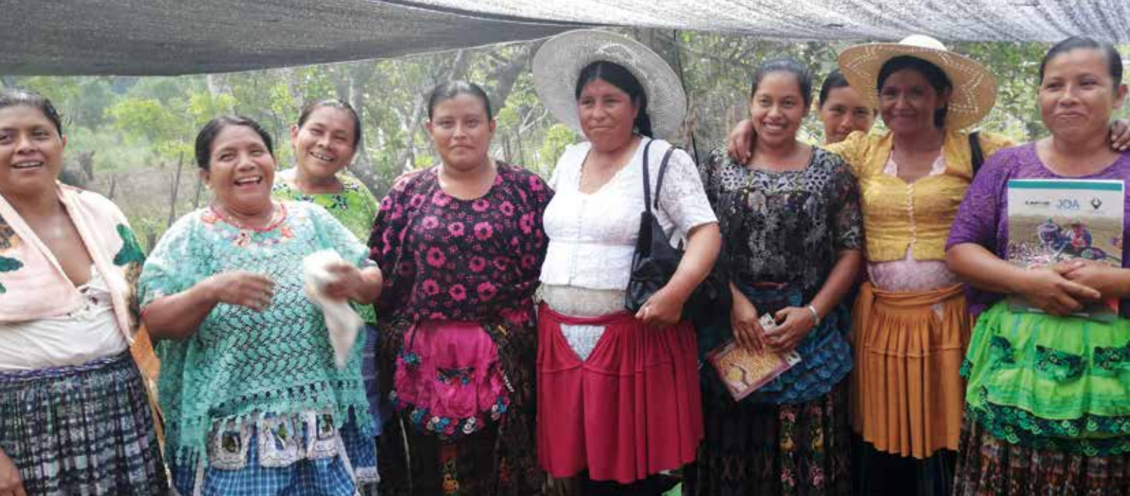
Agroecology, food sovereignty, solidarity economy and feminism are aligned movements that work towards building other ways of being in the world.

bly (p. 21) suggests that the risk of co-optation can be greatly reduced when movements organise not around agroecology as a practice, but around more fundamental demands, including those for women's leadership, horizontal ways of collaborating and for perspectives that emphasise care rather than profit or control.