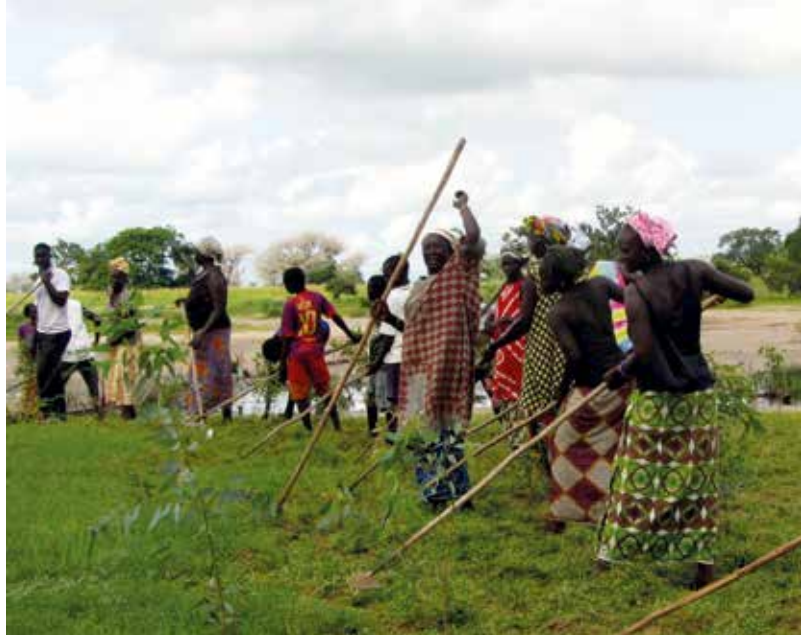
We cannot assume that agroecology is already feminist in itself.

A feminist agroecological transition must go hand in hand with changes in relationships and roles between men and women in their homes, building new forms of coexistence. This, together with the equal distribution of care work, would allow women to occupy some of the spaces that are currently taken up by men.